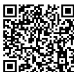
highlights of 55 th anniversary

In hindsight, Carmelians joining hands to stay connected and work together aligned with the major concern in the eventful year of 2019-20. We are proud and honoured to have received very positive and favourable comments in EDB's Focus Inspection in July 2020 on the measures we adopted during class suspension.