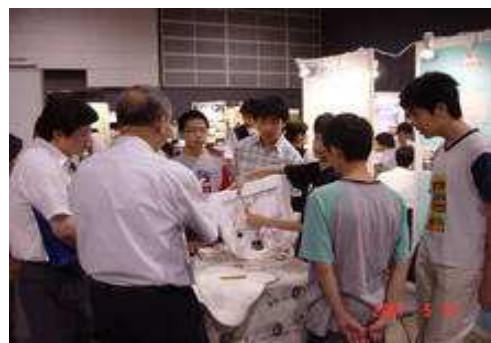
Explaining the circuit of their model to the judges