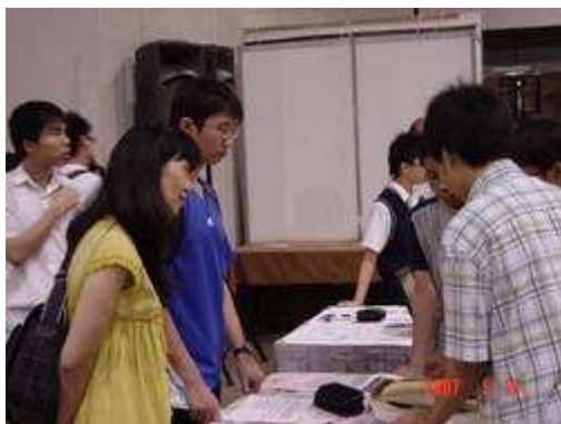
Explaining to visitors how their model works during the exhibition