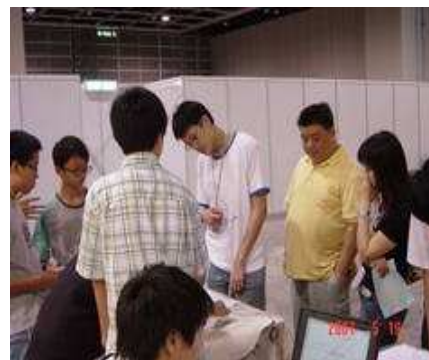
Explaining to visitors how their model works during the exhibition